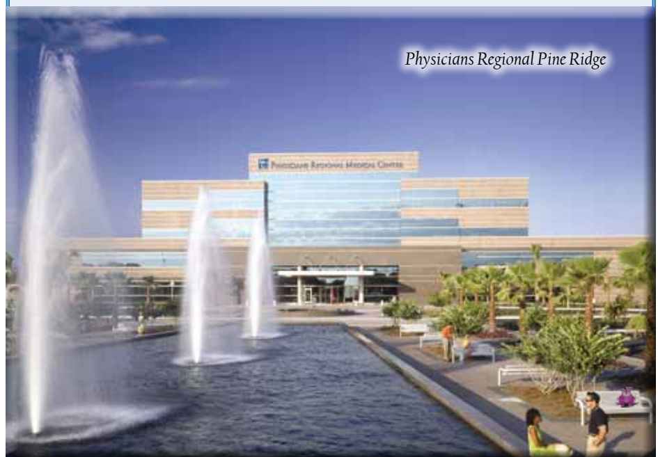
Physicians Regional Pine Ridge